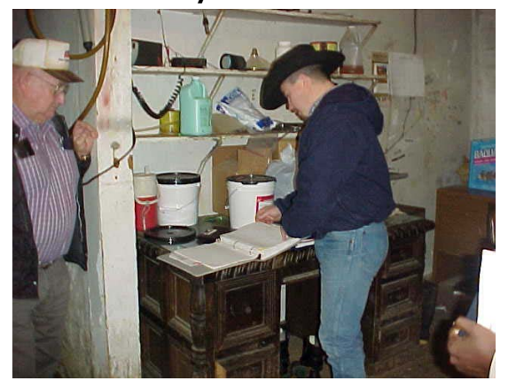
Records should be kept to facilitate nutrient planning and develop written plans for unforeseen emergencies.

Management Practices showing a concern for environmental health and safety.