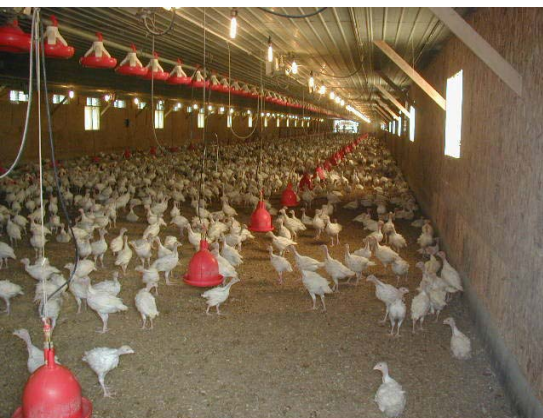
Bell waterers help maintain dry litter.