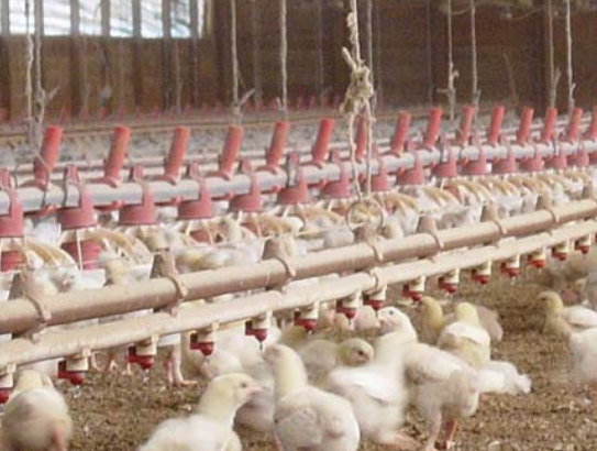
Leaking waterers complicates litter management.