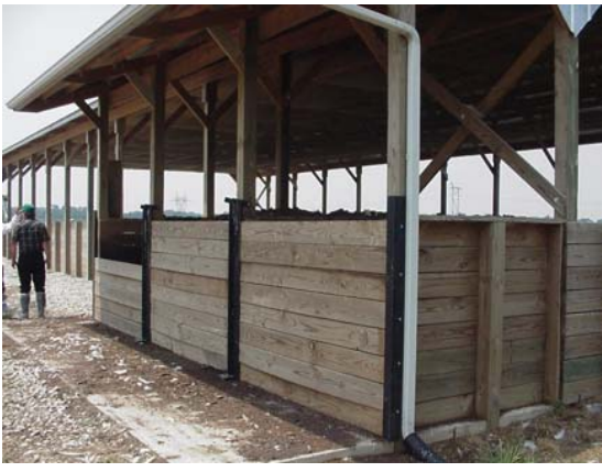
Composting mortalities conserves nutrients and may be later used as fertilizer.