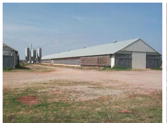
Well designed and maintained poultry units.

• Best Management Practices can be applied to poultry confinement areas.