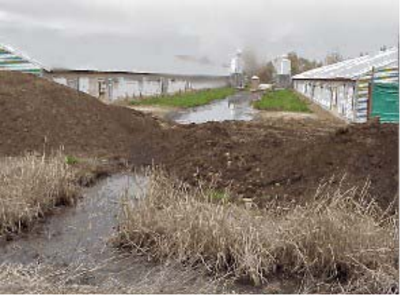
Runoff from uncovered litter stockpile.