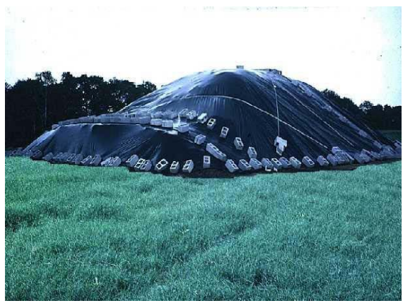
This litter pile is a good example of proper short-term field storage. It is secured with a tarp and weights.

• Improperly stored and managed wastewater could pollute surface or ground water.