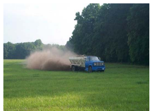
Even litter application from a calibrated spreader truck.