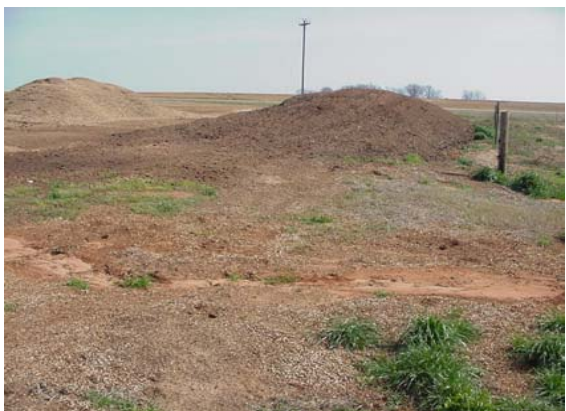
Litter stockpiles subject to runoff and leaching.