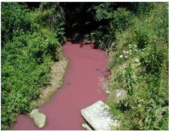
Egg wash waste contaminates a stream and causes a fish kill.