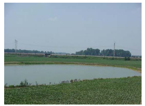
Well designed and maintained layer wastewater lagoon.

Poultry manure (litter) and wastewater can be managed and stored to protect water quality.