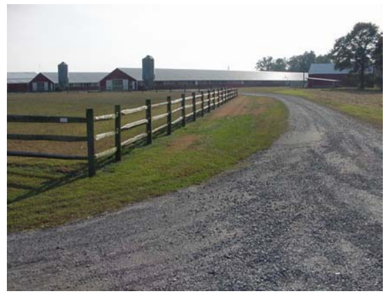
Well maintained and managed poultry facility.

Some practices could harm the environment and affect public opinion.