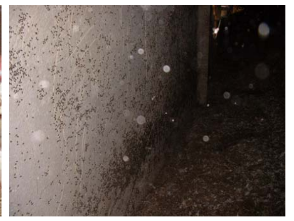
Poorly controlled fly population covers the wall of this poultry facility.