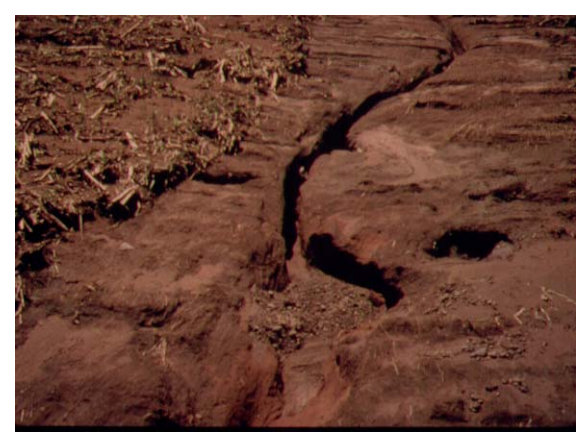
Improper application of manure on erodible soils can pollute surface water.