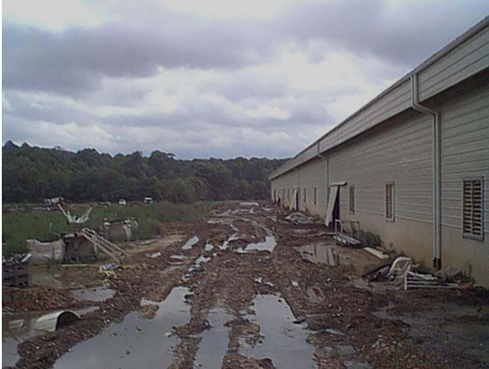
Poorly managed facilities could affect public opinion.