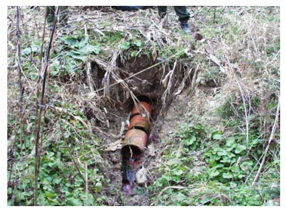
Land application on fields with sub-surface drainage tiles could result in a discharge.