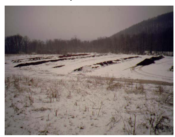
Litter stockpiles subject to runoff.

Some practices could harm the environment and affect public opinion.