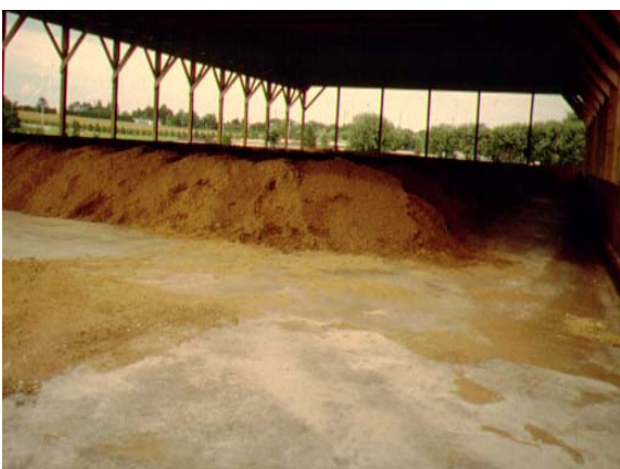
Properly managed litter in a storage shed.