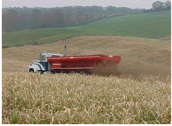
Litter application on fields with good vegetative cover.