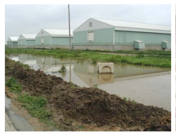
Poorly maintained facility affects storm water management.