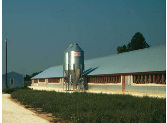
Precision feed management and the addition of phytase promotes animal health and nutrient management.