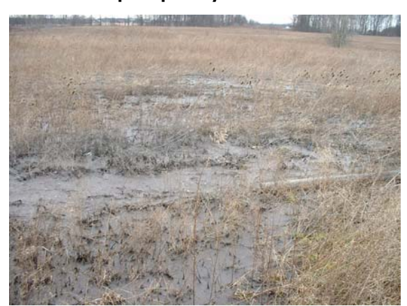
Improperly released wastewater from layer manure storage could pollute ground and surface water.

• Improperly stored and managed wastewater could pollute surface or ground water.