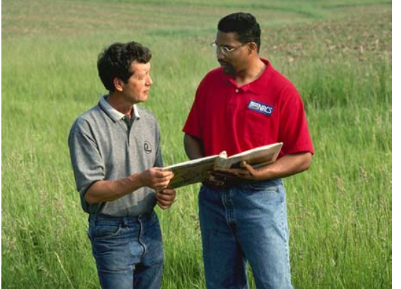
Creating and following nutrient management plans could improve the quality and productive capacity of soils