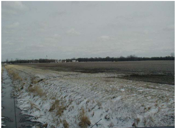
Applying litter and wastewater to frozen soils can result in runoff.