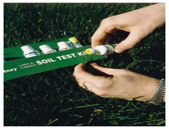
Testing soils helps determine nutrient levels and plan for land application of manure.

For further assistance please contact your local office of USDA's Natural Resources Conservation Service or Extension office, EPA, conservation district, state environmental agency, or state conservation agencies. For assistance in contacting these local offices, to obtain copies of this document or other types of assistance, contact EPA's Ag Center by calling toll free 1-888-663-2155 or at www.epa.gov/agriculture.