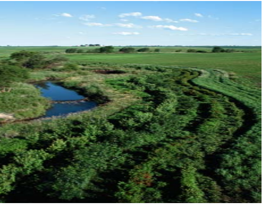
Grass filter strips protect surface water from litter and wastewater application.