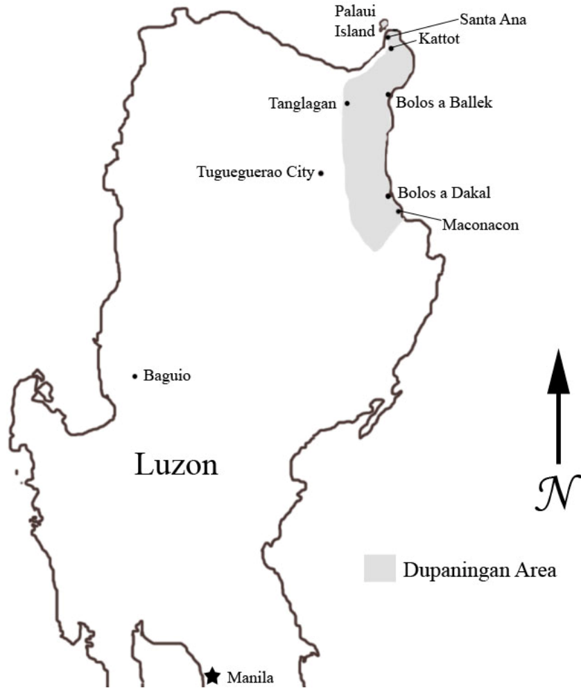
Figure 1.1 Map of Dupaningan Agta area

In 2006, when this work was undertaken, the single largest community of Dupaningan Agta was in Bolos Point (known to the Dupaningan as Bolos a Ballek ‘Small Bolos’, in contrast with Bolos, Maconacon (known to the Dupaningan as Bolos a Dakal ‘Large Bolos’). An official local government census reported 68 households of Dupaningan Agta at Bolos Point in July 2006. Bolos Point is an isolated community along the Pacific coast and must be accessed by boat from the towns of Maconacon or Santa Ana. Bolos Point has a mix of both Agta and non-Agta, although the two groups tend to self-segregate, with the non-Agta living on the side of the river where the town