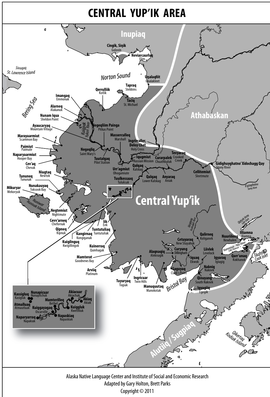
Map 2: Central Yup'ik Area