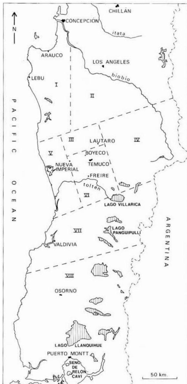
Map 2: Distribution of Mapuche dialects. Dialect subgroup boundaries after Croese (1980).