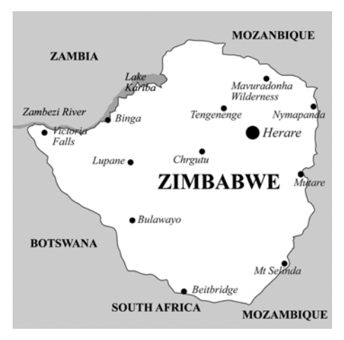
Figure 1. Map of Zimbabew

Zimbabwe is a beautiful country that lies on the great southern African plateau. Being in the subtropical region, the vegetation is predominantly savanna with short scattered bushes and lush grass to feed the livestock and, of course, provides ample substrate for mushroom cultivation. The year is divided into two main seasons the hot and wet summer stretching from October to March and the long dry winter covering the remaining months of the year. Although summer temperatures are often oppressive, in excess of 35 °C in the southeast Lowveld, the northern Highveld region is often cooler with a summer average of 26 °C and receiving more rainfall (about 1,500mm per annum versus 500mm in the Lowveld). The eastern highlands receive the highest annual rainfall amounts (2,500mm+) distributed more or less evenly throughout the year and enjoy temperatures averaging 18 °C. The region, naturally, is home to most of the wild