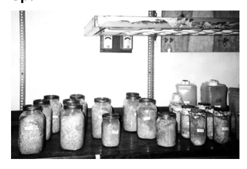
Figure 2. Oyster mushroom spawn marketed in bottles

Spawn production is perhaps the most important factor limiting mushroom industry, not only in Zimbabwe, but in other countries in the region as well. Although there are a good number of people trained in microbiology, molecular physiology or basic spawn production techniques, it is unfortunate that setting up these laboratories and purchasing such expensive equipment as autoclaves has been hindered either by lack of capital or interest in this business. Spawn production has, therefore, been historically performed by mushroom enthusiasts as a hobby and only quite recently as a money producing enterprise. Local spawn is widely viewed by investors as inferior in quality. They prefer to import spawn from South African companies. Although the Biotechnology Trust of Zimbabwe