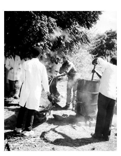
Figure 5. Trainees pasterurizing substrate

Consultants often charge high fees, about ZWD160,000 (USD200) per grower