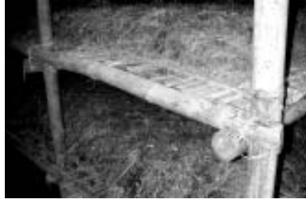
Figure 14. Filling