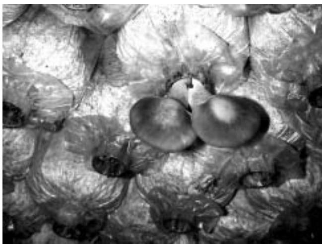
Figure 22, 23. Oyster mushroom and abalone mushroom bags in the shelf

In the meantime, abalone mushrooms are harvested once a week and the production cycle takes a year. The average yield is 500g/kg a year. The mushrooms sell at THB40 (USD1.03)/kg in wholesale markets and THB50 (USD1.29)/kg in retail markets. As a new item, they fetch relatively high prices compared with oyster mushrooms.