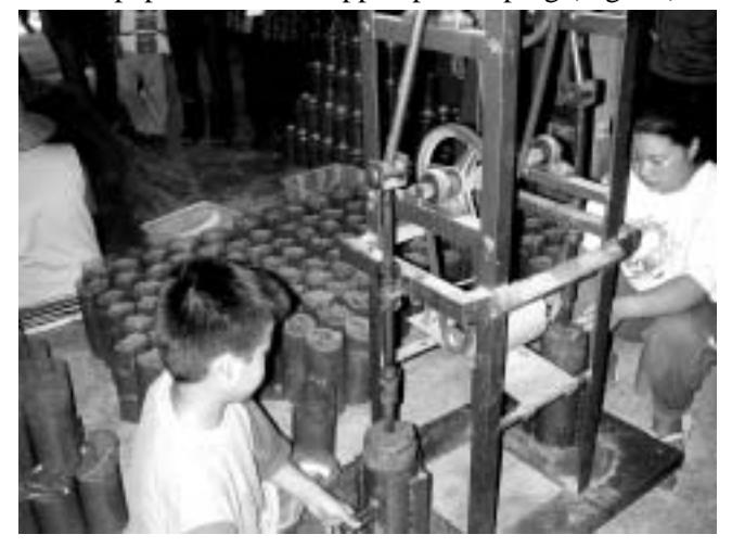
Figure 16. Compacting Machine

They commonly use a plastic ring to make a "bottle neck" for easy handling. They put a plastic ring on the bag end, pull out the bag end through the ring, fold down the pulled out part, tie it with a rubber band and plug with cotton, paper or cotton-topped plastic plug (Fig. 17).