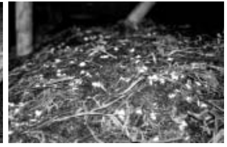
Figure 15. Spawn run (8 days after spawning)