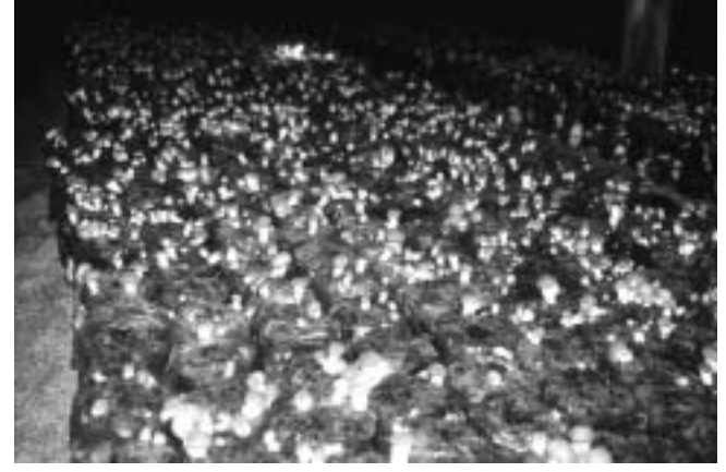
Figure 28. Shiitake grown on the floor