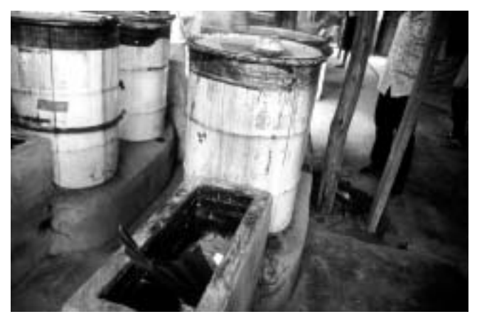
Figure 18. Traditional oil-drum sterilizer