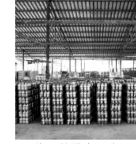
Figure 20. Inoculation