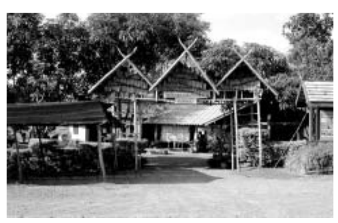
Figure 3. Where Royal Mushroom Project is being Implemented