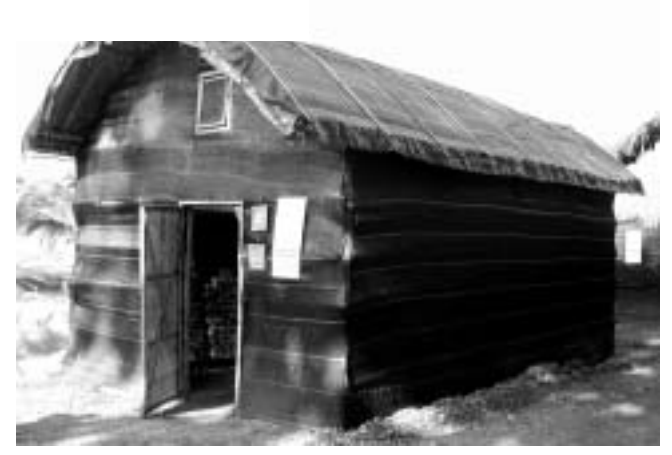
Figure 4. A mushroom growing house for Royal Mushroom Project