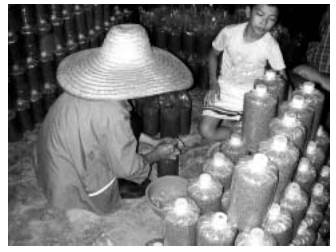
Figure 17. Plugging