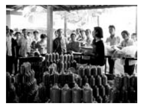
Figure 2. Rural community people taking mushroom growing lessons

In addition the warm climate favorable for mushroom growing, well-established growing practices and their will to pave their way for a better life, the long & successful mushroom production in Thailand are owed to the sincere efforts and considerable support made by the Kingdom of Thailand and Thai government to enhance Thai people's life by encouraging mushroom growing. The kingdom initiated Royal Mushroom Projects aimed at promoting rural development in Thailand (Fig. 3, 4, 5, 6, 7). The government runs loan programs for rural communities, some of which adopt a mushroom production cooperative. More mushroom production at the community level is expected, enriching rural people.