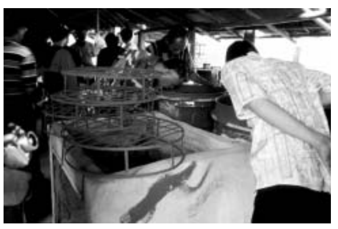
Figure 19. Metal grate for oil drum sterilizer