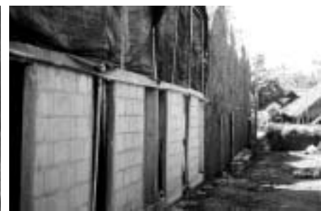
Figure 8. Typical mushroom growing houses made of thatch and wooden poles