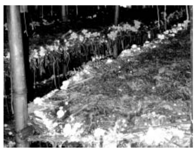
Figure 12. Straw mushroom on the shelf