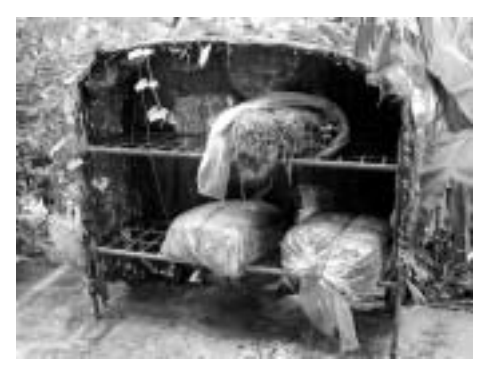
in a simple way

Indoor cultivation of straw mushroom is performed all through the year. Figure 10. Straw mushroom growing Being a secondary saprophyte like button mushroom (Agaricus bisporus), straw mushrooms grow well in organic compost, where the ingredients are