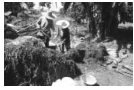
Figure 13. Outdoor composting

This farm produces 1 ton of mushroom per year in the 2 rows of 4 tier shelves with a total growing area of 144 ( 2 \text{ rows} \times 4 \text{ tiers} \times 2 \text{m} wide \times 9 \text{m} long) square meters. Another farm we visited uses two 5-tier shelves 9 m long, 1.7m wide with a yield of 13 \text{kg/m}^2 . The farm produces 200 kg per crop. Yields have not been "satisfactory" yet. Local mushroom demand from fast food restaurant chains like Pizza Hut and McDonald's are met by imported mushrooms from Holland and Australia. And it sells at around THB52 (USD1.3) per kg. Farm sanitation practices are required for high yields of quality mushroom production.