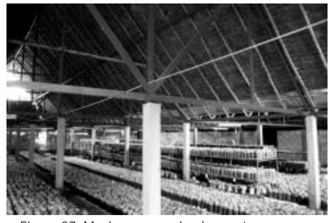
Figure 27. Mushroom growing bags at spawn run

As grown in relatively low temperatures, shiitake ( Lentinula edodes ) can be cultivated mostly in the highland areas with cooler temperatures or at lower altitudes in the cool season. Shiitake is one of the most expensive edible mushrooms in Thailand because there exist relatively unfavorable conditions for cultivation of those mushrooms. To provide better conditions, mushroom growers cover the roof with a shade net and pour cold water through the roof for evaporative cooling. To induce fruiting, they use icy water. Unlike other mushrooms, shiitake require cooler temperatures and are cultivated on the ground. The floor is limed to prevent fungal contamination, especially from green mould. A 1kg substrate bag costs THB5-7 (USD0.13-0.18). Mushroom growers harvest 3-4 flushes or 7-9 flushes in a crop.