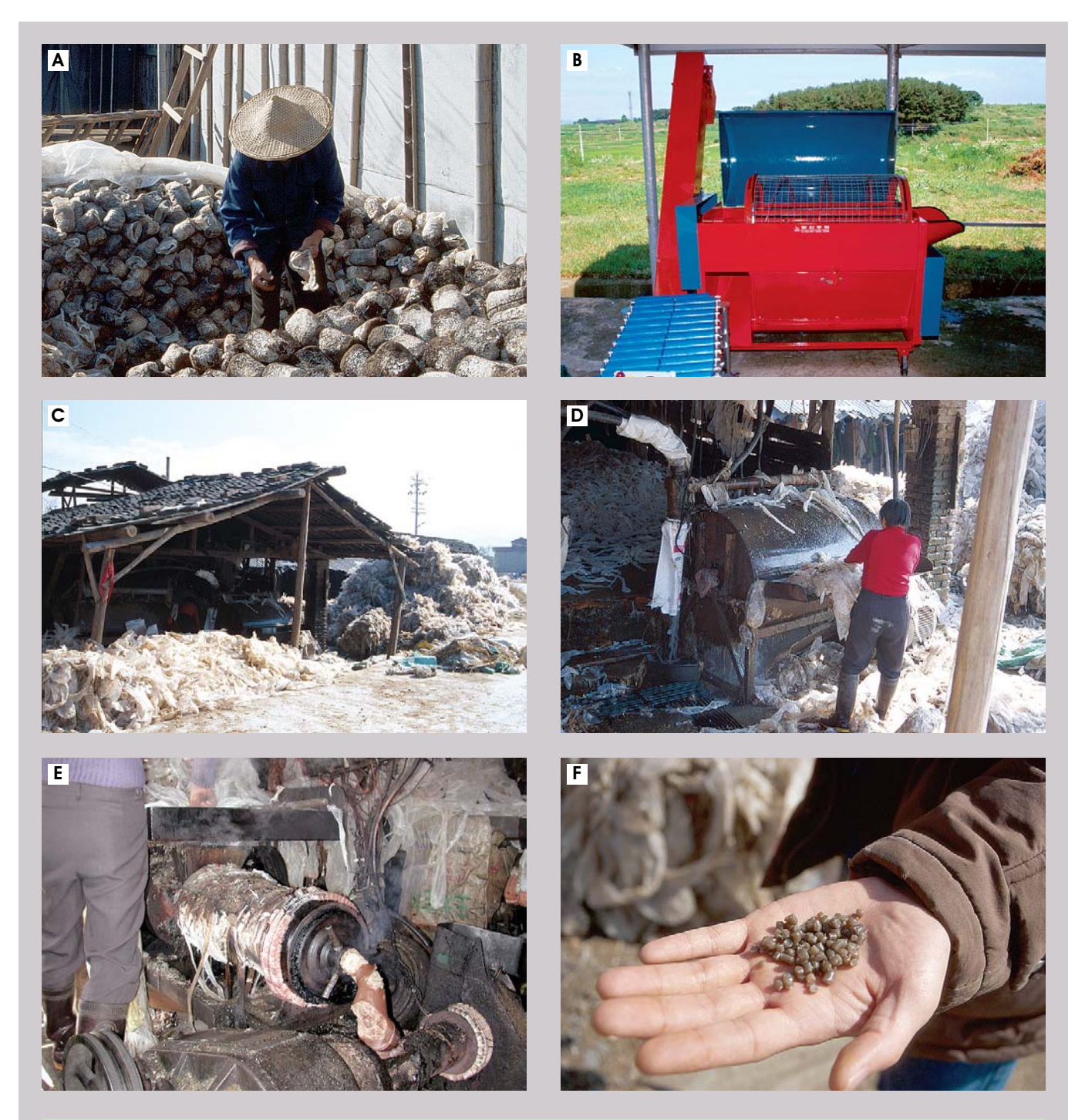
Figure 4. Plastic bags are recycled into other products. Plastic bags are peeled from substrate by hand (A) or machine (B). The bags are transported to a centralized location for recycling (C) where they are cleaned mechanically (D). They are then heated into a mass (E) and reformed as raw material (F) to produce recycled plastic products.

10. Plastic bag recycling. Plastic bags are used to hold and form the shiitake substrate. These spent plastic bags can be recycled into other reusable plastic materials (sources: MushWorld; Hsu, L. , USA, Unicorn Imp. & Mfg. Corp., pers. com.) (Figs. 4).