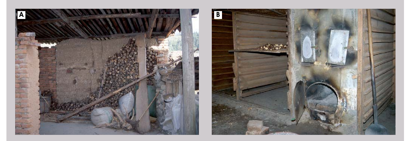
Figure 3. Spent shiitake substrate is first air dried (A) and then utilized as a fuel source for a mushroom drier (B).

7. Alternative fuel. Spent shiitake logs have been used as alterative fuel (Dias, E. S., Brasil, pers. com.; Pauli, 1999) (Figs. 3).