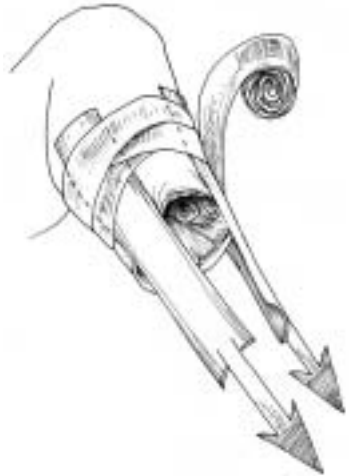
Fig. 25-1. Skin Traction