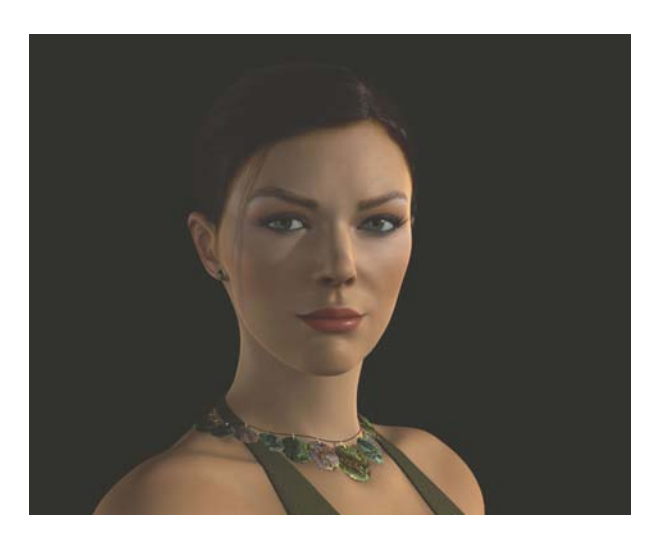
Figure 2. Unprecedented visual realism. Modern GPUs can use programmable shading to achieve near-cinematic realism, as this interactive demonstration shows, featuring actress Adrianne Curry on an NVIDIA GeForce 8800 GTX.

Increases in precision have accompanied increases in programmability. The traditional graphics pipeline provided only 8-bit integers per color channel, allowing values ranging from 0 to 255. The ATI Radeon 9700 increased the representable range of color to 24-bit floating point, and NVIDIA's GeForce FX followed with both 16-bit and 32-bit floating point. Both vendors have announced plans to support 64-bit double-precision floating point in upcoming chips.