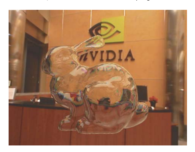
Figure 1. Programmable shading. The introduction of programmable shading in 2001 led to several visual effects not previously possible, such as this simulation of refractive chromatic dispersion for a "soap bubble" effect.

GPUs have evolved from a hardwired implementation of the graphics pipeline to a programmable computational substrate that can support it. Fixed-function units for transforming vertices and texturing pixels have been subsumed by a unified grid of processors, or shaders, that can perform these tasks and much more. This evolution has taken place over several generations by gradually replacing individual pipeline stages with increasingly programmable units. For example, the NVIDIA GeForce 3, launched in February 2001, introduced programmable vertex shaders. These shaders provide units that the programmer can use for performing matrix-vector multiplication, exponentiation, and square root calculations, as well as a short default program that uses these units to perform vertex transformation and lighting.