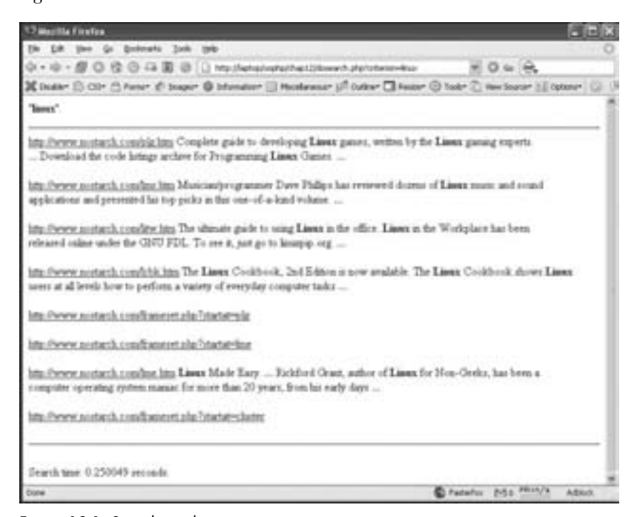
Figure 12-1: Search results

View the dosearch.php page in a browser, add the query string ?criterion=linux to the URL, and the SoapClient will return a result from Google's API. You should get site-specific search results that look something like those shown in Figure 12-1.