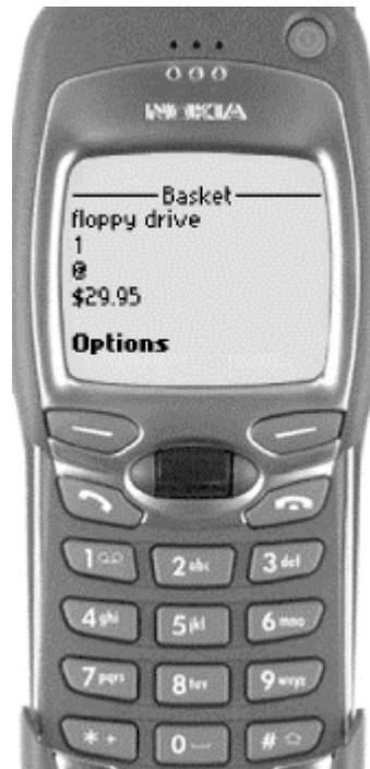
Figure 7.2. Shopping basket with poor table support

A browser with poor table support may render the same information in a format like Figure 7.2 .