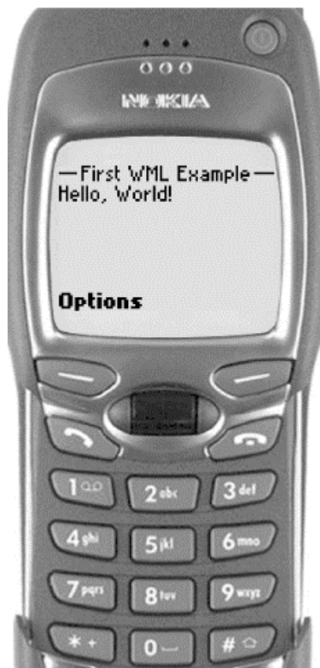
Figure 1.1. Example 1.1 displayed in a WAP browser

The second thing to note is that all tag names are in lowercase (tags are inside angle brackets). This is important: unlike HTML, where <HTML> , <html> , <Html> , and <HTMl> all refer to the same thing, in WML, tag names are case-sensitive . All current WML tag names are lowercase, so you must enter them that way in your pages.