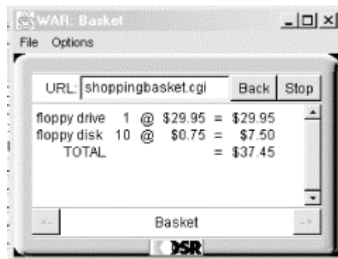
Figure 7.1. Shopping basket with good table support

Figure 7.1 shows a browser with good table support.