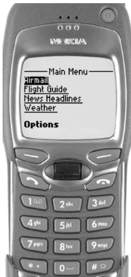
Figure 4.1. Menu of available pages

While the <do> element is useful, it isn't always what you want. Many cell phone browsers put all the <do> items in a card in a single menu, which means you can't guarantee it will appear where you want it to. Sometimes you want to make some of the text into an HTML-style link, rather than have a separate <do> control next to it. For example, if you have a menu of other pages available, you want the items in the menu to display in the correct order, as in Figure 4.1 .