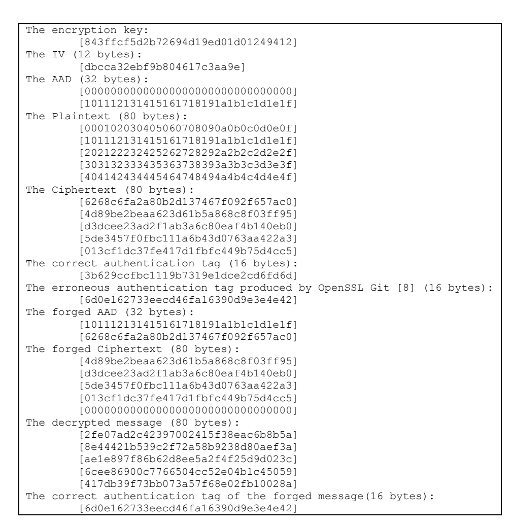
Fig. 4. Forgery Example 2.